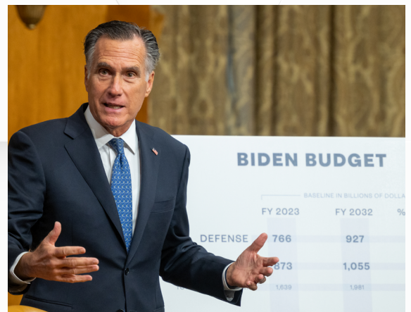
During a committee hearing on the Biden Administration’s FY 2023 budget, Senator Romney discusses the urgent need to get spending under control.