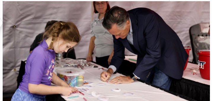
Senator Romney colors a button during Utah Tech University’s Welcome Back BBQ to celebrate the start of the fall semester.