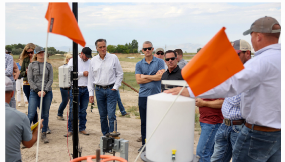
Senator Romney meets with Utah farmers and ranchers to learn about their innovative conservation efforts.