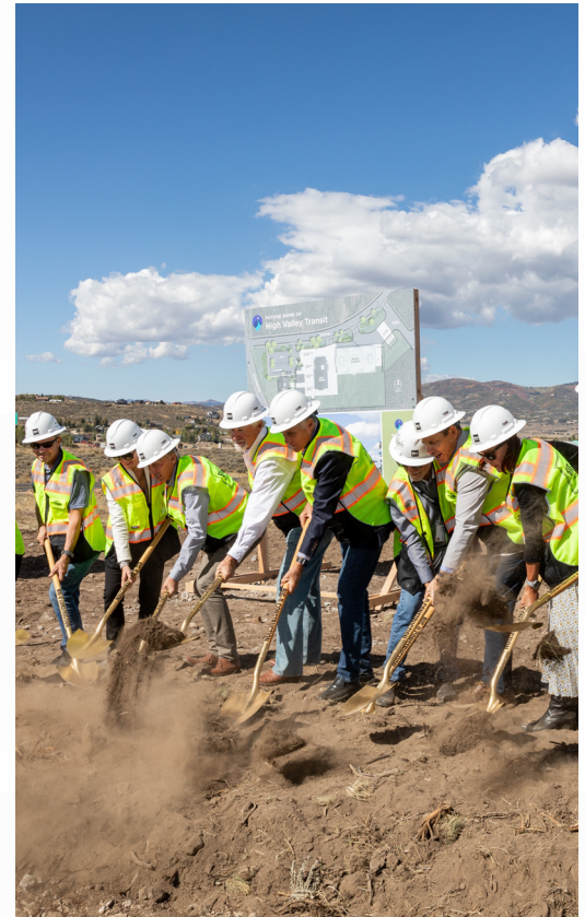
Senator Romney participates in the groundbreaking for High Valley Transit’s first facility project in Summit County, which received funding from the infrastructure bill to help alleviate the traffic impacts of high growth and high tourism.