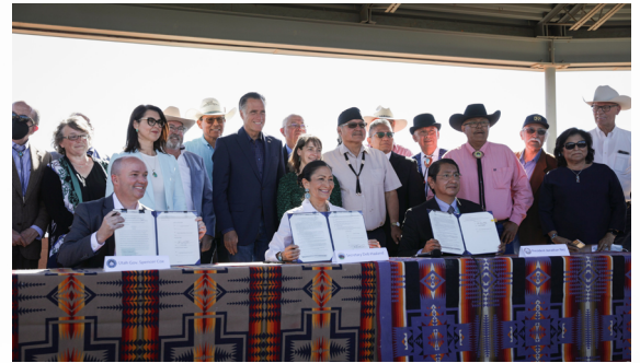
Senator Romney participates in the signing ceremony for the Navajo Utah Water Rights Settlement with Interior Secretary Haaland, Governor Cox, and Navajo Nation President Jonathan Nez.