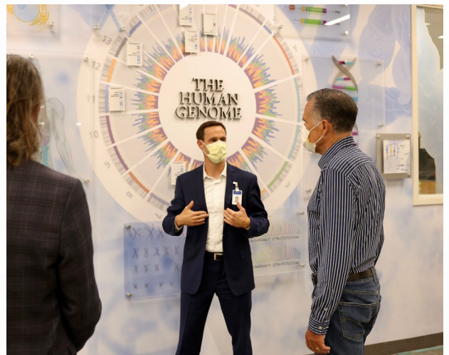
Senator Romney tours Intermountain’s Precision Genomics facility in St. George to learn more about the HerediGene study—their cutting edge genome mapping that is helping advance the treatment of cancers and other diseases.