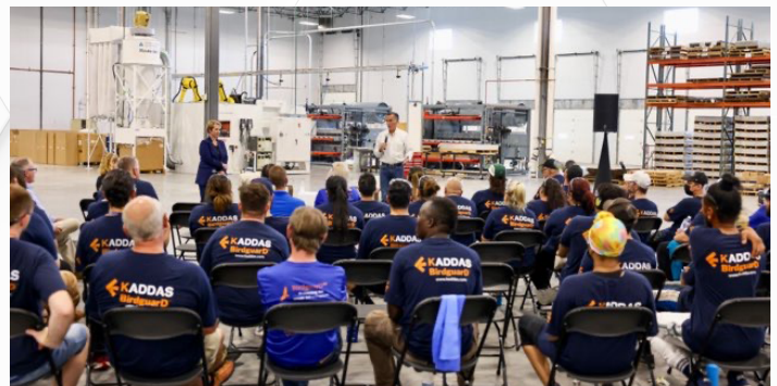
Senator Romney meets with employees at Kaddas Enterprises' thermoplastic manufacturing facility in Salt Lake City to discuss challenges facing U.S. manufacturers.