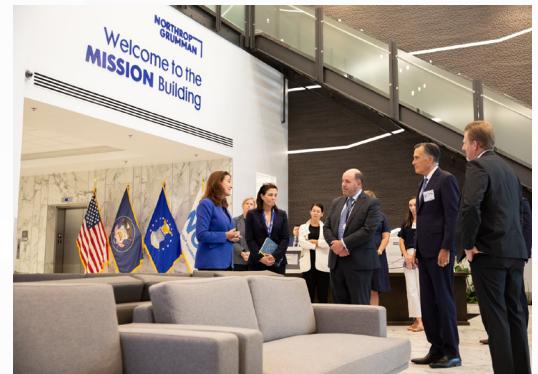
Senator Romney visits the Roy Innovation Center to discuss the Sentinel program's role in our deterrence efforts.