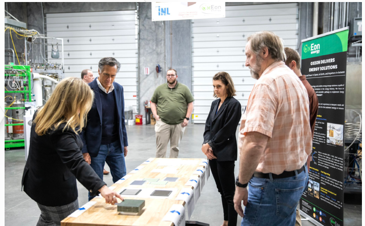
In North Salt Lake, Senator Romney tours OxEon Energy's manufacturing facility to learn more about their work to create sustainable clean energy technologies.