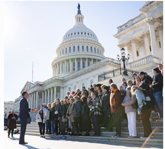
During their visit to Washington, Senator Romney welcomes Utah high school students to the U.S. Capitol.