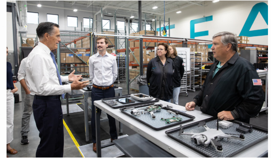
Senator Romney tours Utah's Teal Drones, which is helping secure our domestic supply of drones.