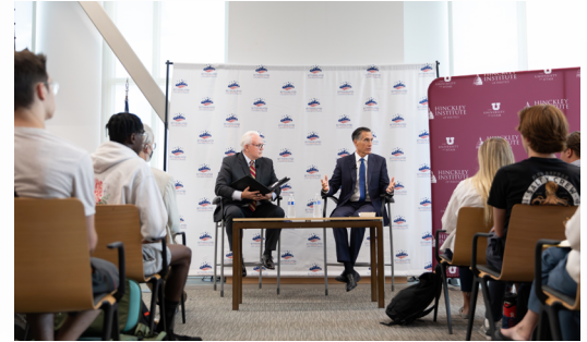
Senator Romney speaks with University of Utah students during an event with the Sutherland Institute.