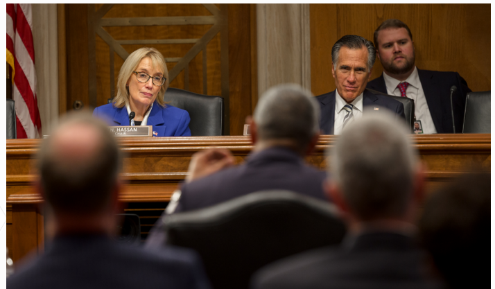
Senator Romney, along with Senator Hassan (D-NH), leads a Homeland Security and Governmental Affairs Committee Hearing to examine federal COVID-era spending and solutions to prevent fraud in future emergency spending.