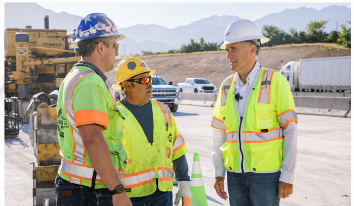
Senator Romney tours a Utah Department of Transportation jobsite along I-80 to see how funds from the bipartisan infrastructure bill are being used to expand Utah's roads and highways.