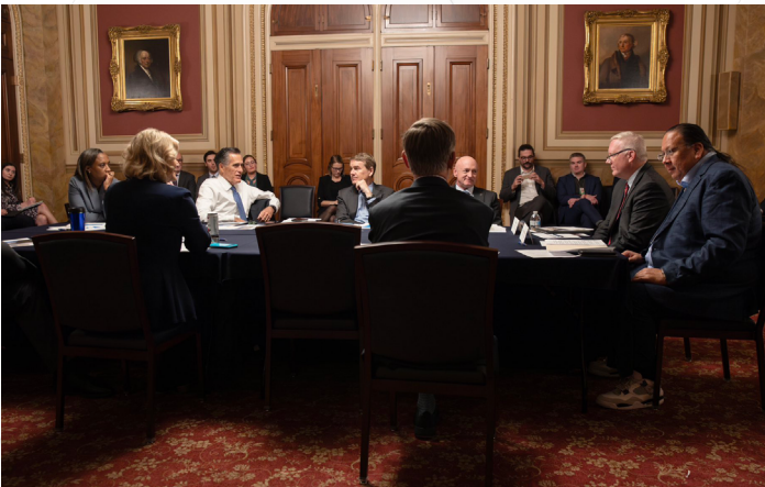
Senator Romney meets with Great Salt Lake Commissioner Brian Steed and the bipartisan group of senators from the Colorado River states to discuss water conservation efforts in Utah and the West.