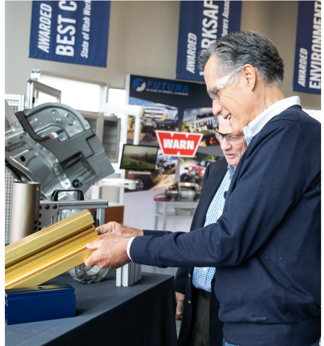
Senator Romney tours Bonnell Aluminum in Clearfield to discuss how China’s predatory tactics in materials markets threaten Utah businesses and the U.S. industrial base.